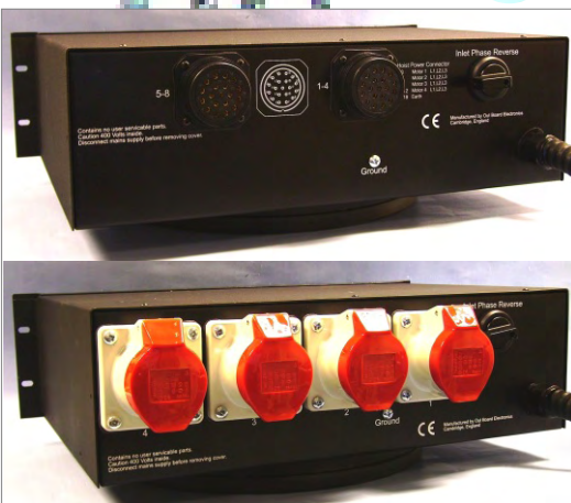
DV8 / DV4 Rear

Automatically corrects reversed inlet phase (LV hoists only)